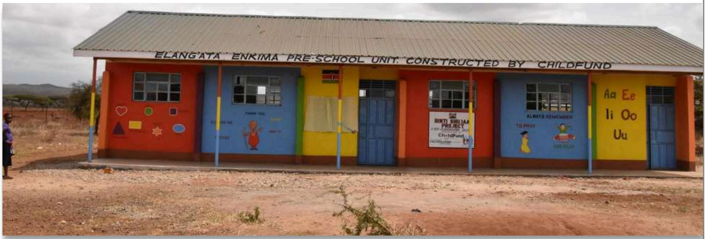
Front view of the ECD Centre constructed