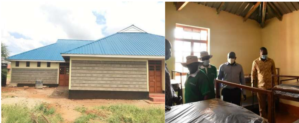
120-bed capacity Girls' dormitory