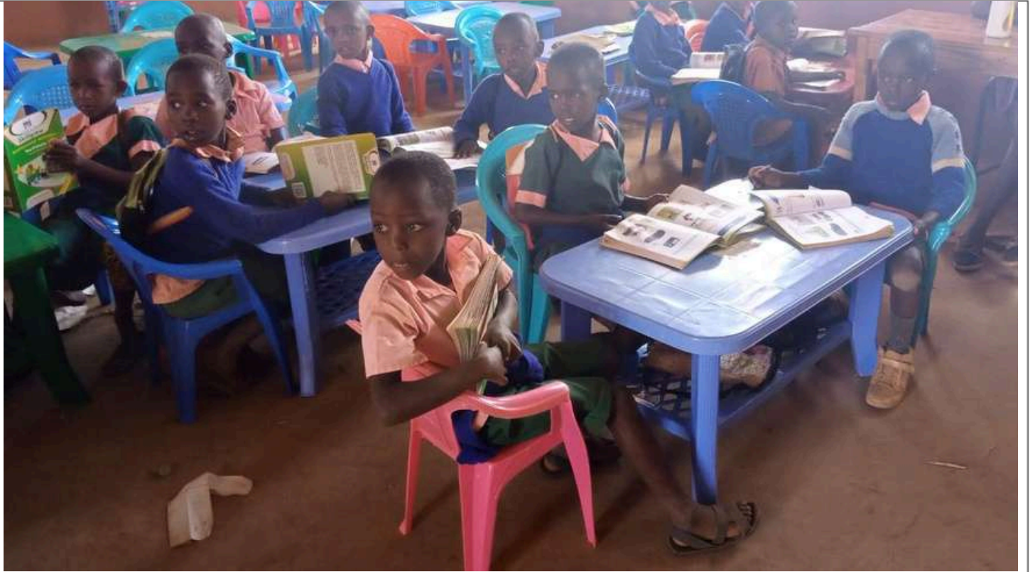
Pre-Primary 2 Learners at the newly constructed ECD Centre