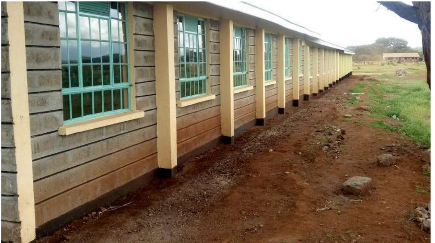
Rear pictorial view of the 8No. classroom block